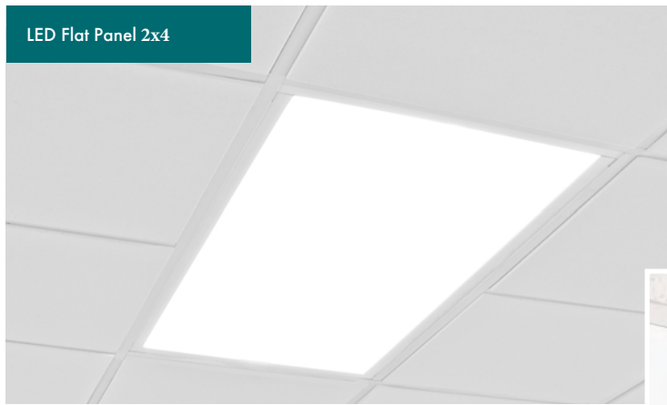
Optional Wireless Sensor Shown Installed